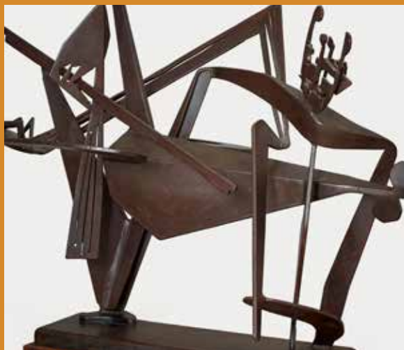
David Smith, Cello Player , 1946. Steel, paint, 33 3/8 x 40 1/4 x 19 3/8 in. (84.8 x 102.2 x 49.2 cm); wood base, 2 x 27 x 9 in. (5.1 x 68.6 x 22.9 cm). Collection of Audrey and David Mirvish, Toronto. All images © 2022 The Estate of David Smith / Licensed by VAGA at Artists Rights Society (ARS), NY

Find more programs, exhibitions, and events at hydecollection.org