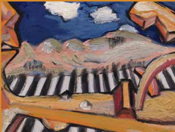
David Smith, Untitled (Terpsichore and Euterpe in Landscape) , 1947. Oil on paper board, 7 1/8 x 9 1/2 in. (18.1 x 24.1 cm), Private collection. © 2022 The Estate of David Smith / Licensed by VAGA at Artists Rights Society (ARS), NY

Find more programs, exhibitions, and events at hydecollection.org